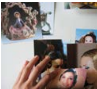
Patricia Esquivias' Folklore series unpicks events of slight importance that nevertheless remain in the collective memory, enabling the artist to present a reading of major historic events loaded with irony and humour.

Chicago-based painter Paul Heyer uses silver lamé as a canvas, a reference to UV-activated clothing in nightclubs, layering utopian symbolism to capture a moment of collective effervescence.