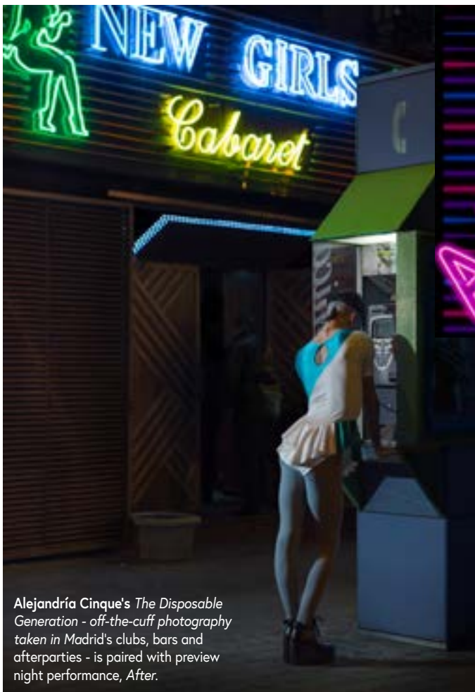
Alejandría Cinque's The Disposable Generation - off-the-cuff photography taken in Madrid's clubs, bars and afterparties - is paired with preview night performance, After .