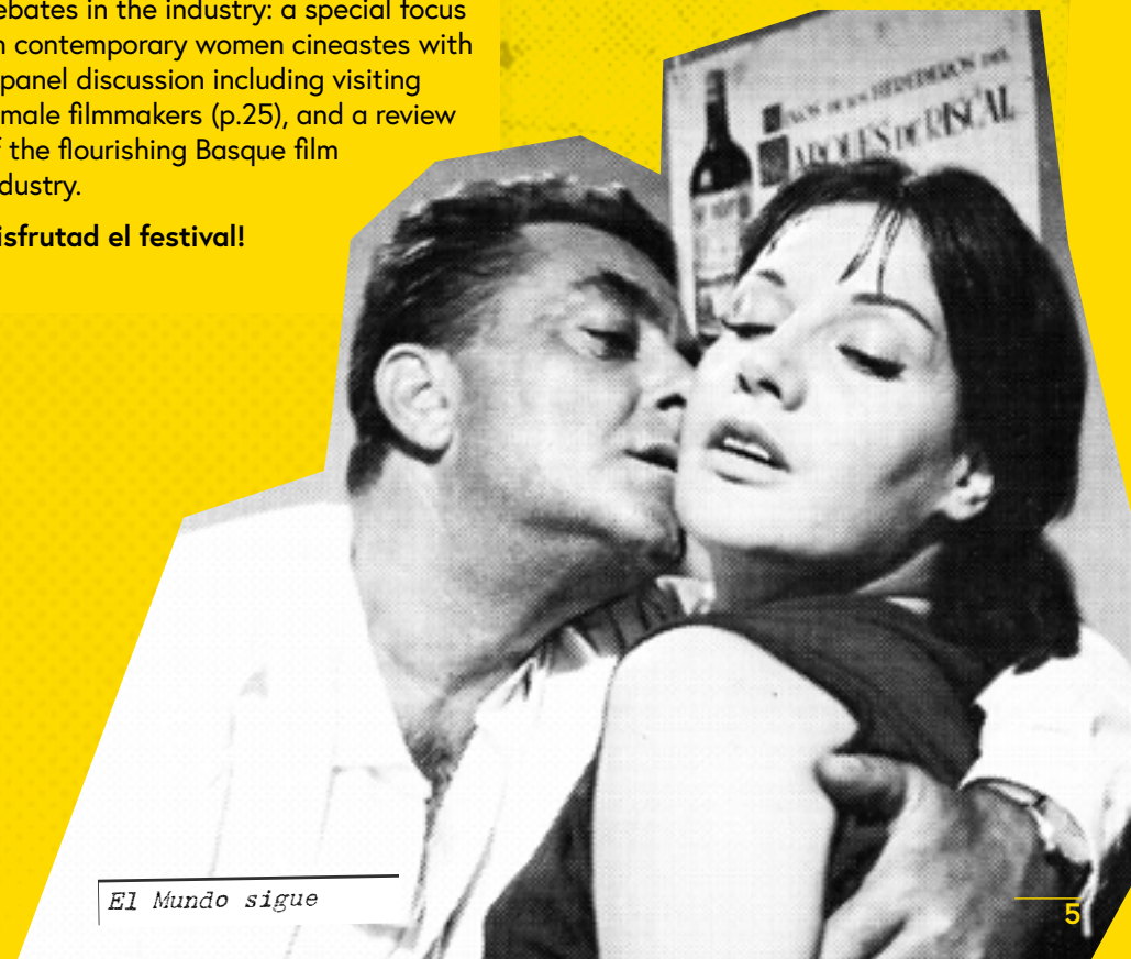
El Mundo sigue