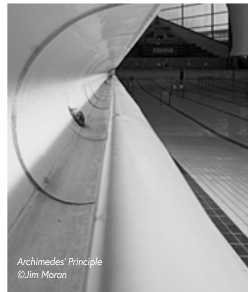
Archimedes' Principle ©Jim Moran