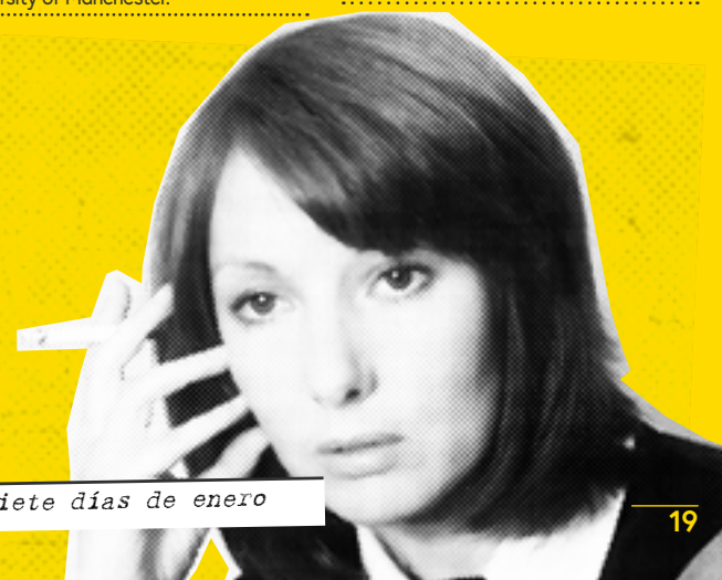
Siete días de enero