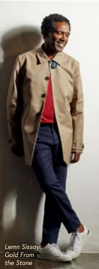
Lemn Sissay: Gold From the Stone