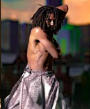
Windows of Displacement