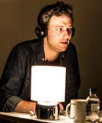
A Hundred Different Words for Love