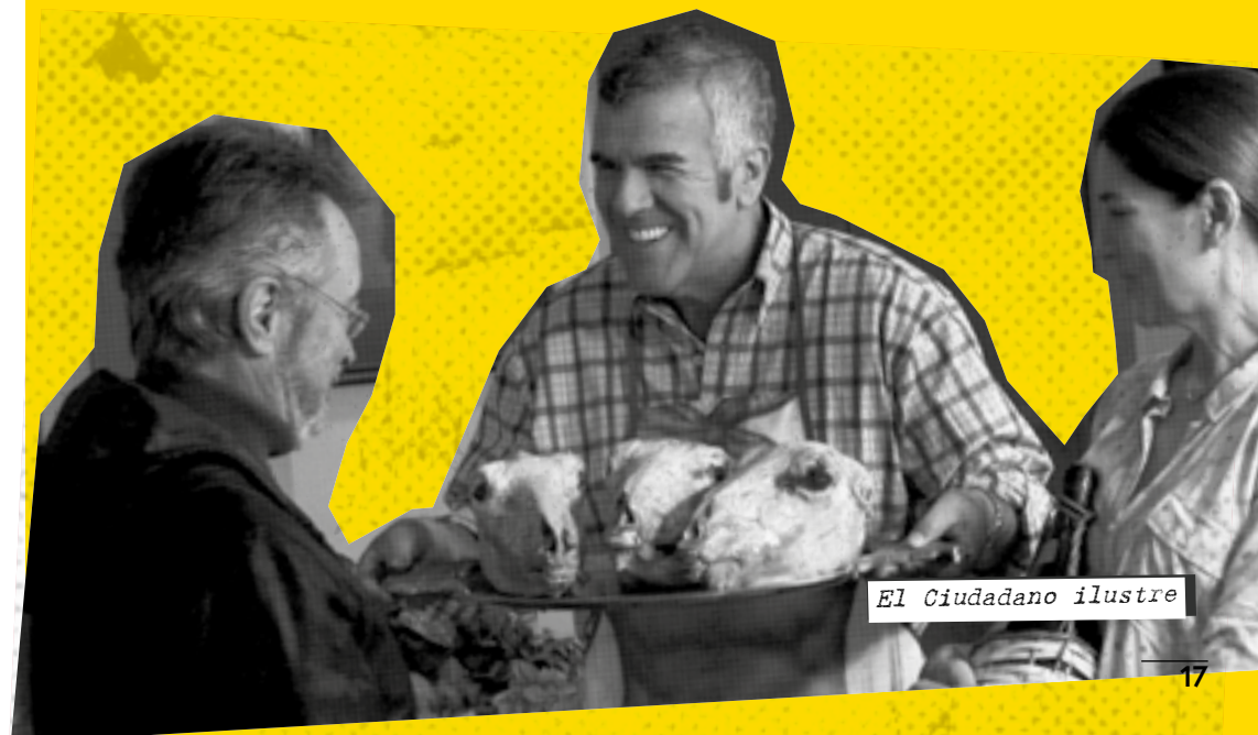
El Ciudadano ilustre

awards: a highly enjoyable and perfectly pitched comedy that deftly skewers socially awkward situations with razor-sharp wit.