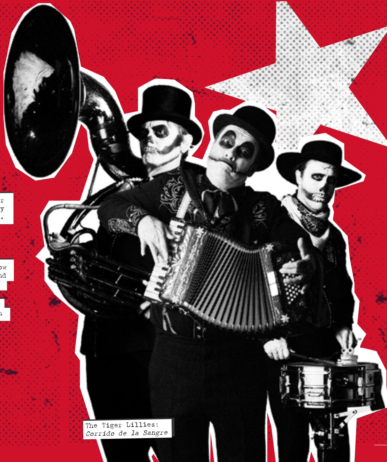
The Tiger Lillies: Corrido de la Sangre

Greater Manchester Arts Centre (HOME) is supported by PRS Foundation's The Open Fund